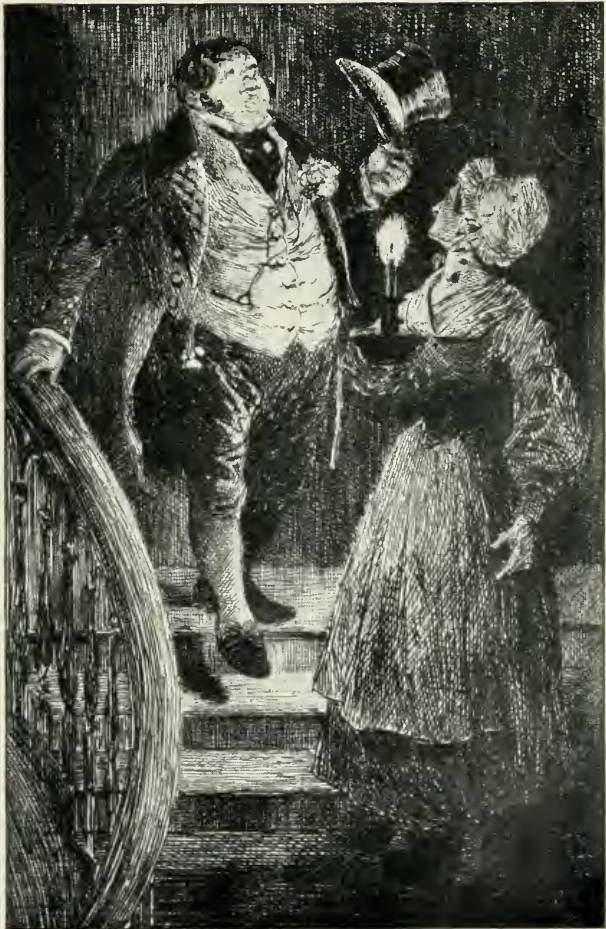
Europe led the way, carrying a candle